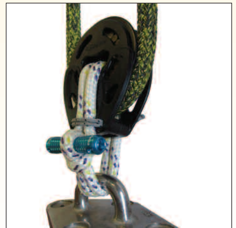
Dogbone on loop to connect block