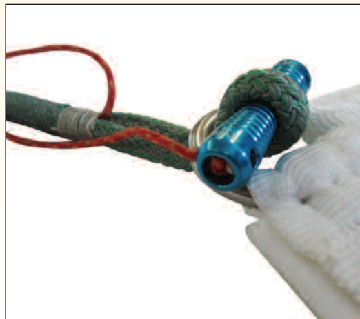
Dogbone used to terminate a sheet